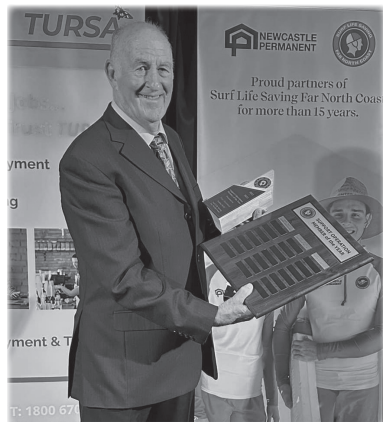
FNC Branch Support Operation Member of the Year