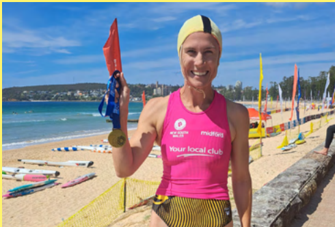
Dual Gold - Jeunesse Meldrum