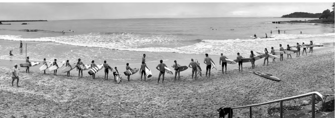
Board Training – Main Beach