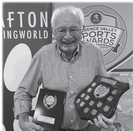
Clarence Valley Sports Awards Club of the Year - Yamba SLSC