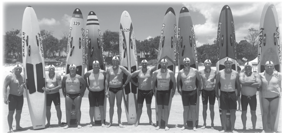
Yamba Masters Male Competitors Masters Carnival – Yamba – Feb. 2024